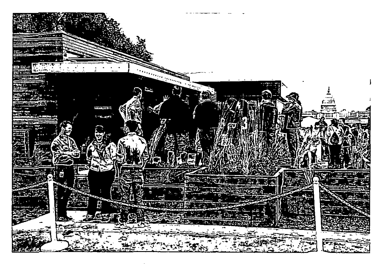
Figure 1. 2009 Solar Decathlon Competition (Washington D.C., October 2009)

The WPPSEF has strived to maintain a balance of funding to support clean energy generation, energy efficiency and conservation, and public education/ outreach. In all three of these categories, the WPPSEF seeks to support job growth whenever possible. Figure 1-3 provide an illustrative example of selected WPPSEF funded projects.