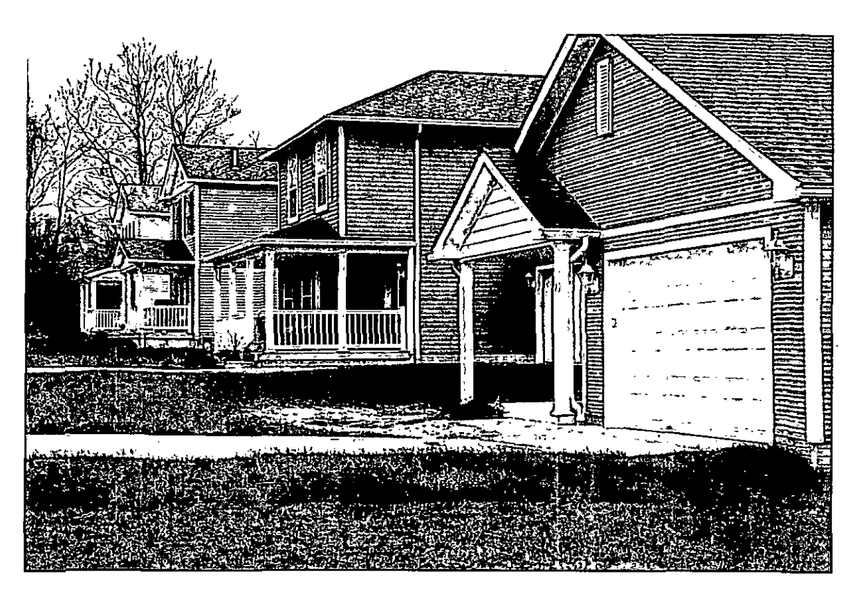
Figure 2. Uniontown Family Homes (Uniontown, PA - Thirty New Energy Star Qualified Homes Assisted by PA Home Energy Program, November 2009)