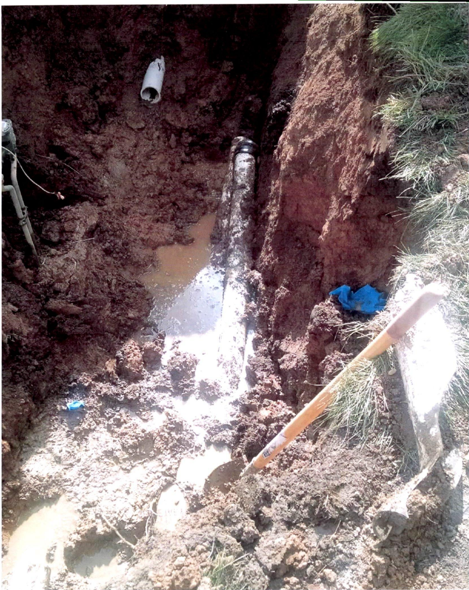
Damaged Sewer Line Removed Note Sewage Pool