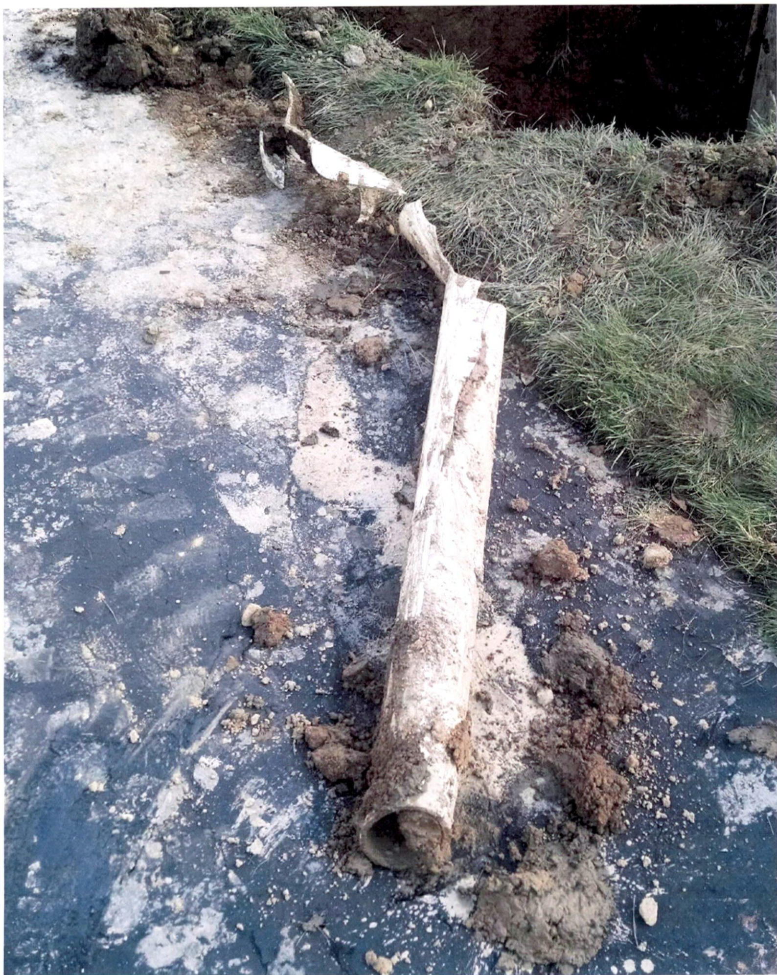
Damaged sewer line