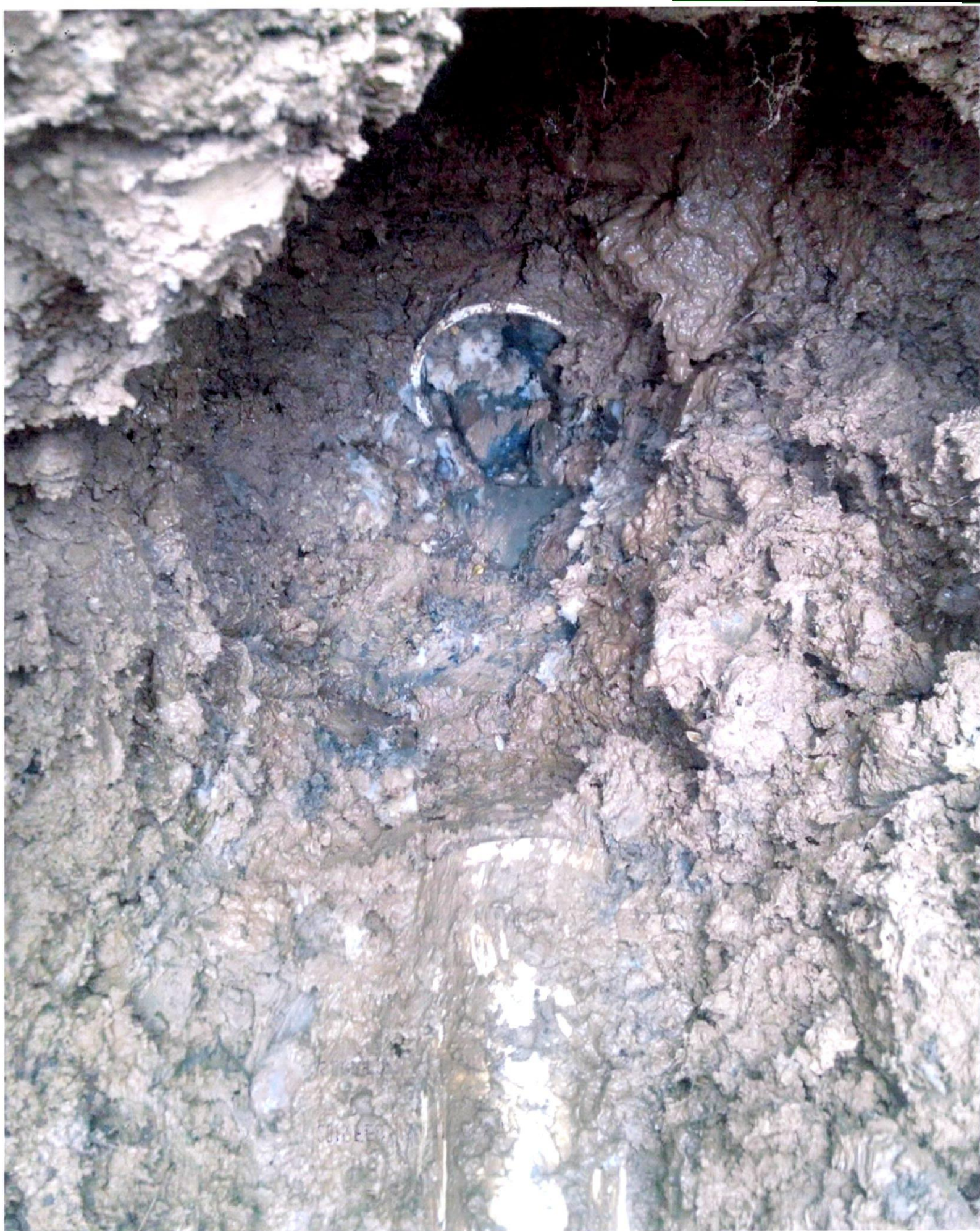
Clogged Sewer Line Not Connected