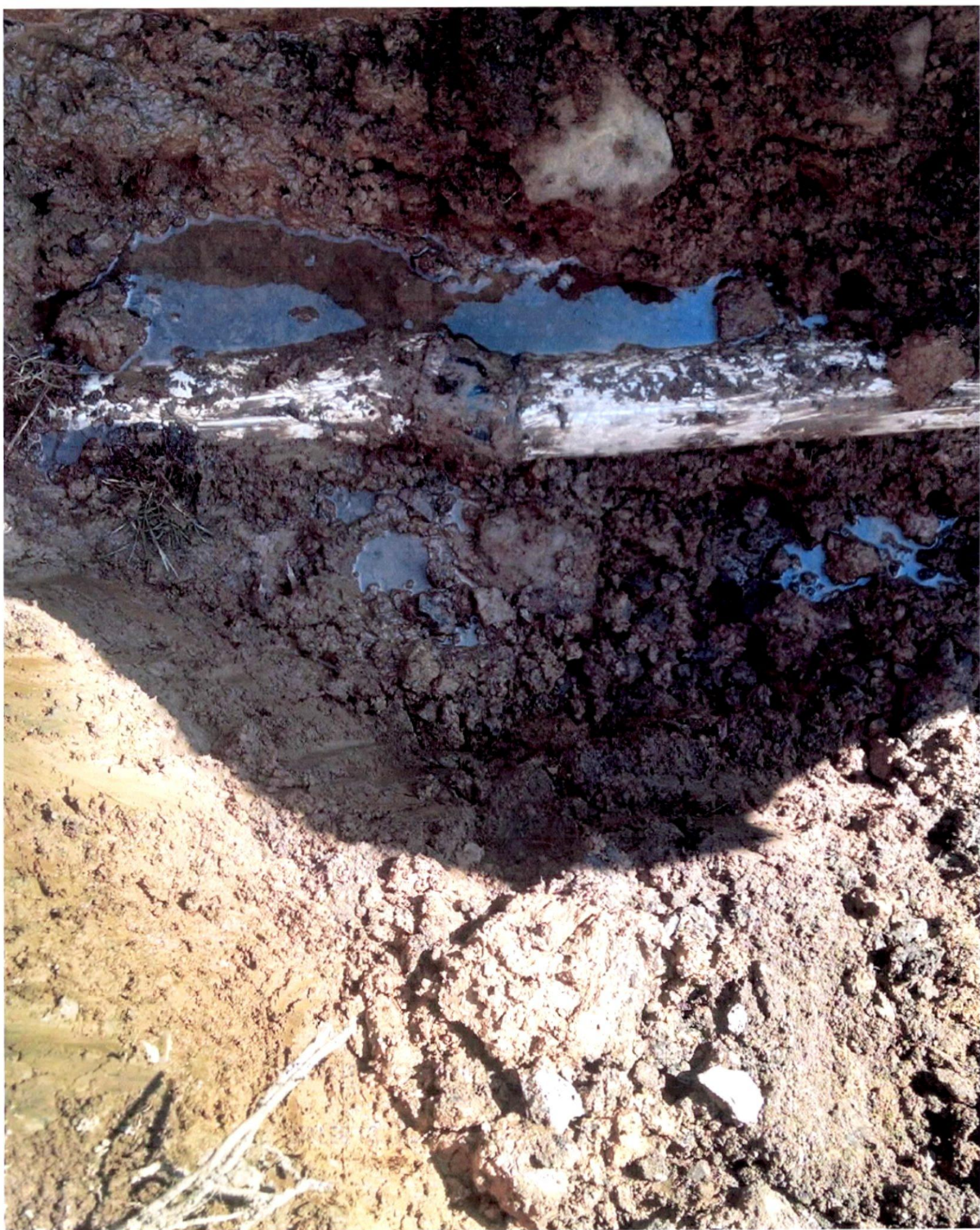
Flexible Connector - Leaking