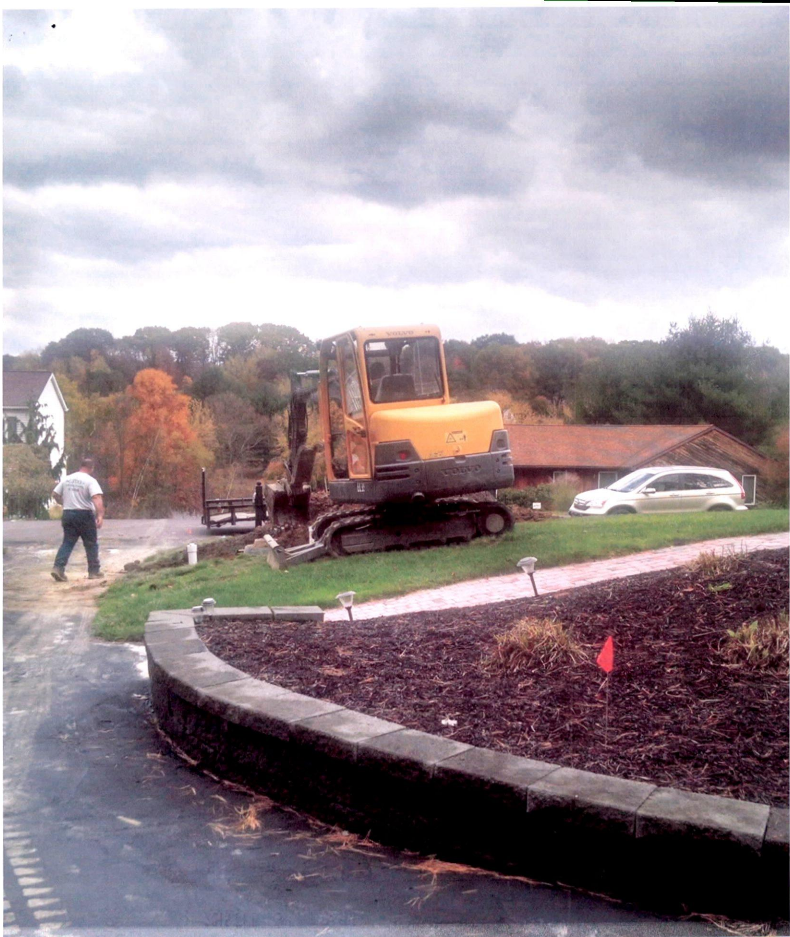
Back Filling after Ernie McCabe's Contractor Repaired Damaged sewer line