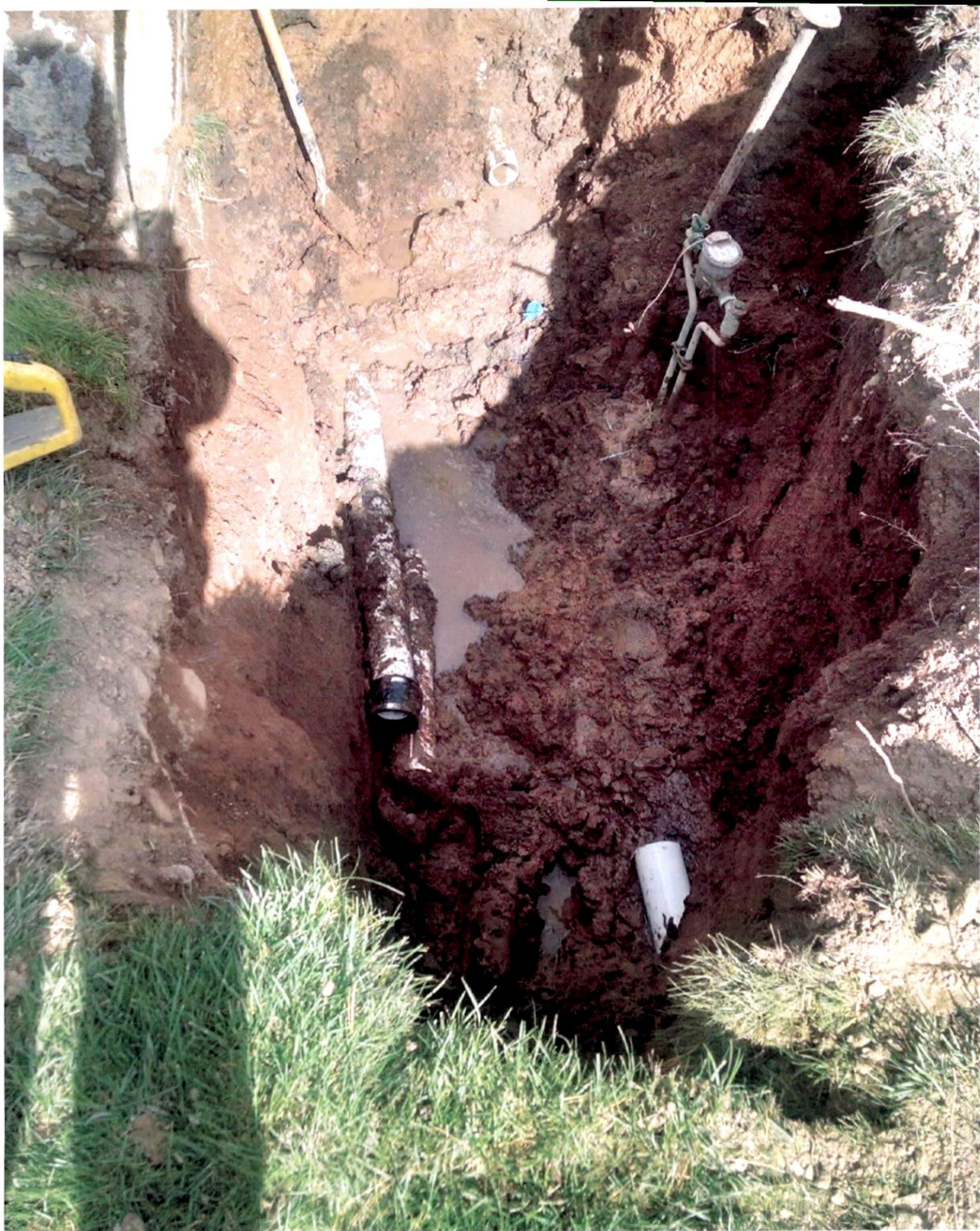
Damaged sewer pipe and sewage drain field