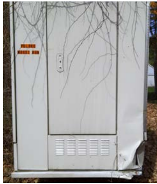
Verizon picture 10/28/15 Shows minor dent in corner