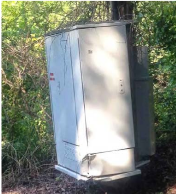
CWA picture petition p. 13