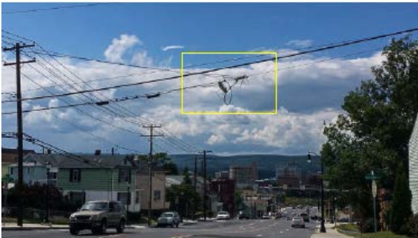
CWA picture petition at 10