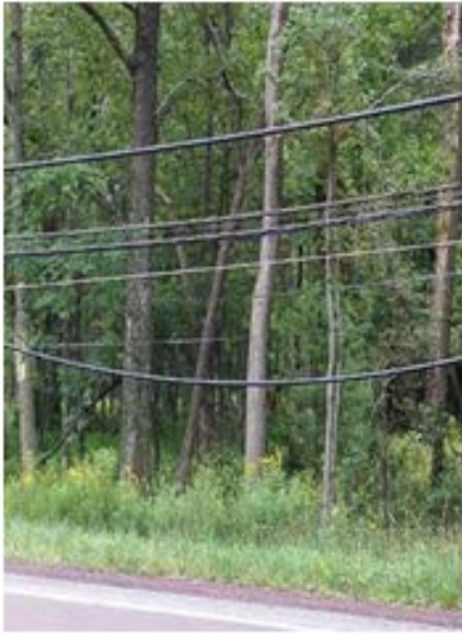
CWA picture petition p. 17