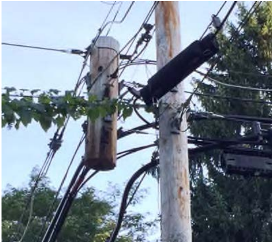
CWA picture petition at 9