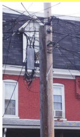
CWA picture petition at 11