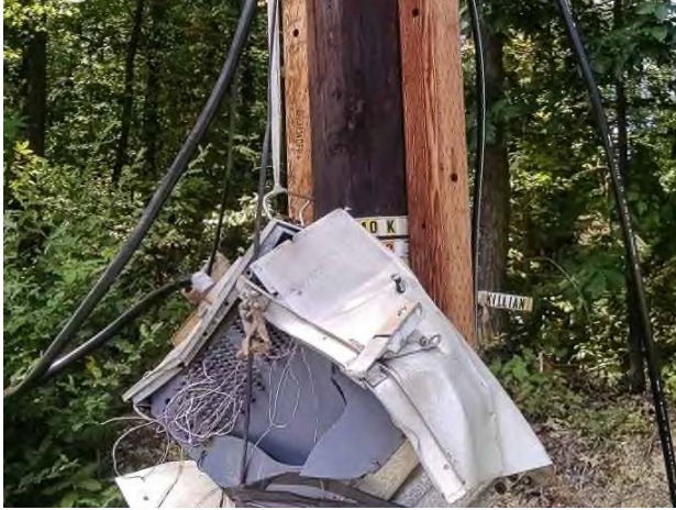
CWA's picture of only the unused, damaged box