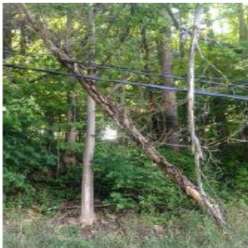
CWA picture petition at 16