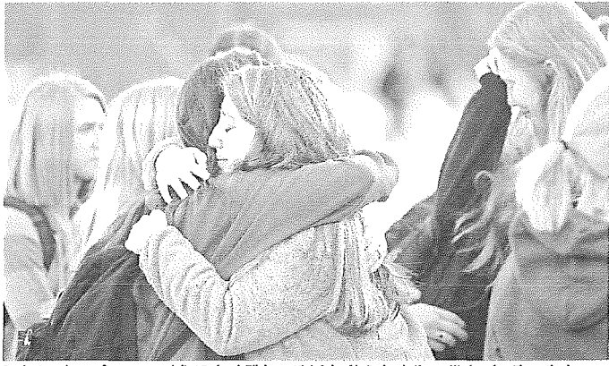
Students embrace after a prayer vigil at Paducah Tilghman High School in Paducah, Ky., on Wednesday. The gathering was held for the victims of the Marshall County High School shooting on Tuesday.

drop on the ground and the bangs con-tinued." Bullets, she said, were "flying