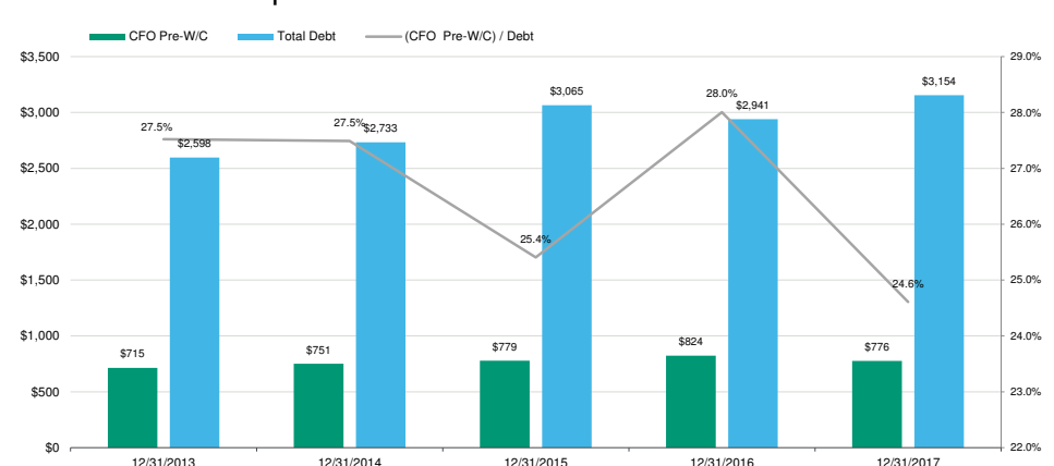
Exhibit 1 Historical Trend of CFO pre-WC to Debt

PECO Energy Company's (PECO) credit strengths include the relatively stable and predictable nature of its regulated electric transmission and distribution (T&D) utility cash flows; the credit supportive regulatory treatment the company has received from the Pennsylvania Public Utilities Commission (PAPUC) and the Federal Energy Regulatory Commission (FERC). These positive factors are balanced against a sizeable capital expenditure program which may pressure the ratio of cash flow from operations pre-working capital (CFO pre-WC) to debt over the next few years to around 20%. Unlike many other utilities, PECO's expected decline in CFO pre-WC to debt is more related to the moderation of profitability rather than tax reform.