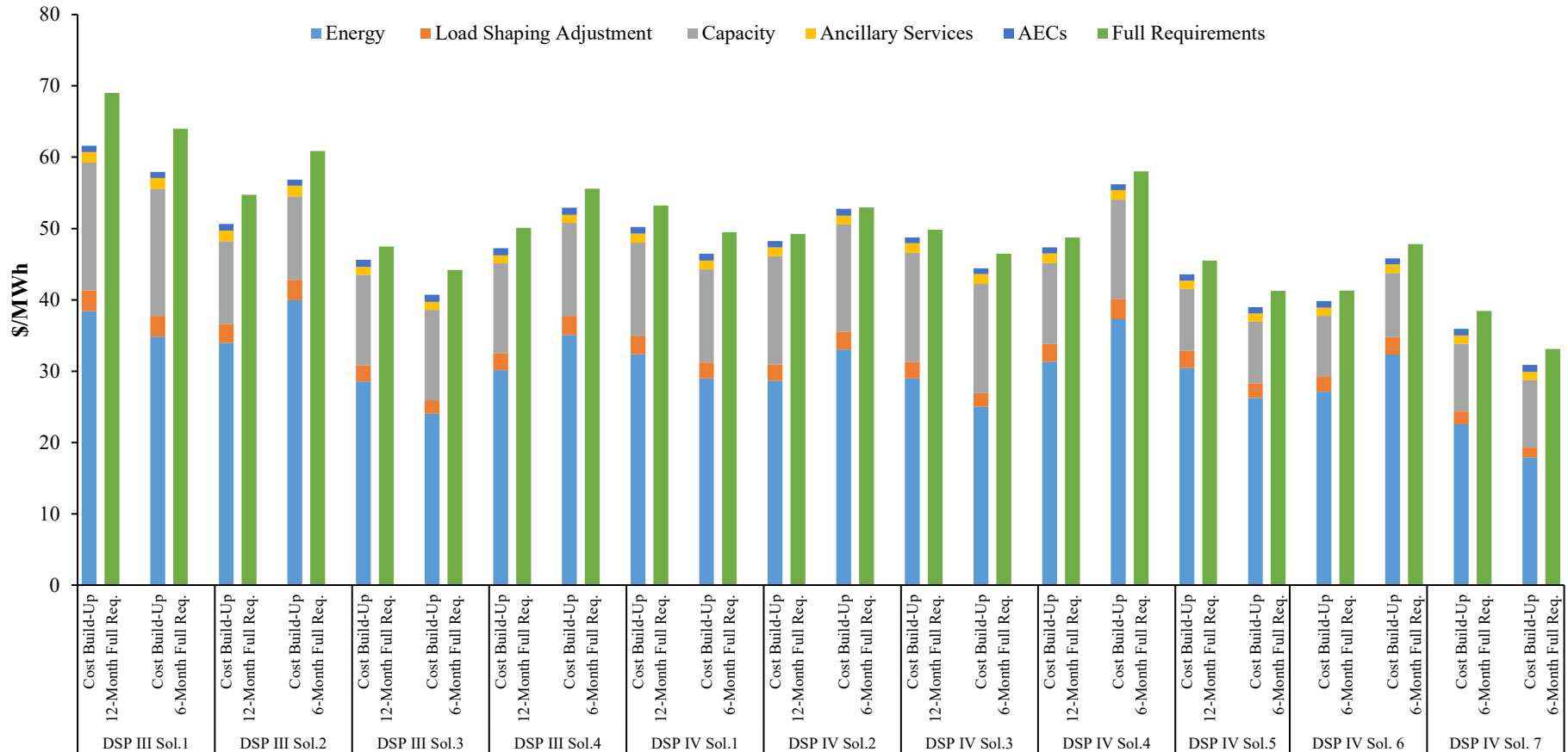
Exhibit JC-5 Revised Cost Build-Up v. Full Requirements Price Small Commercial and Industrial Customer Class DSP III, and DSP IV