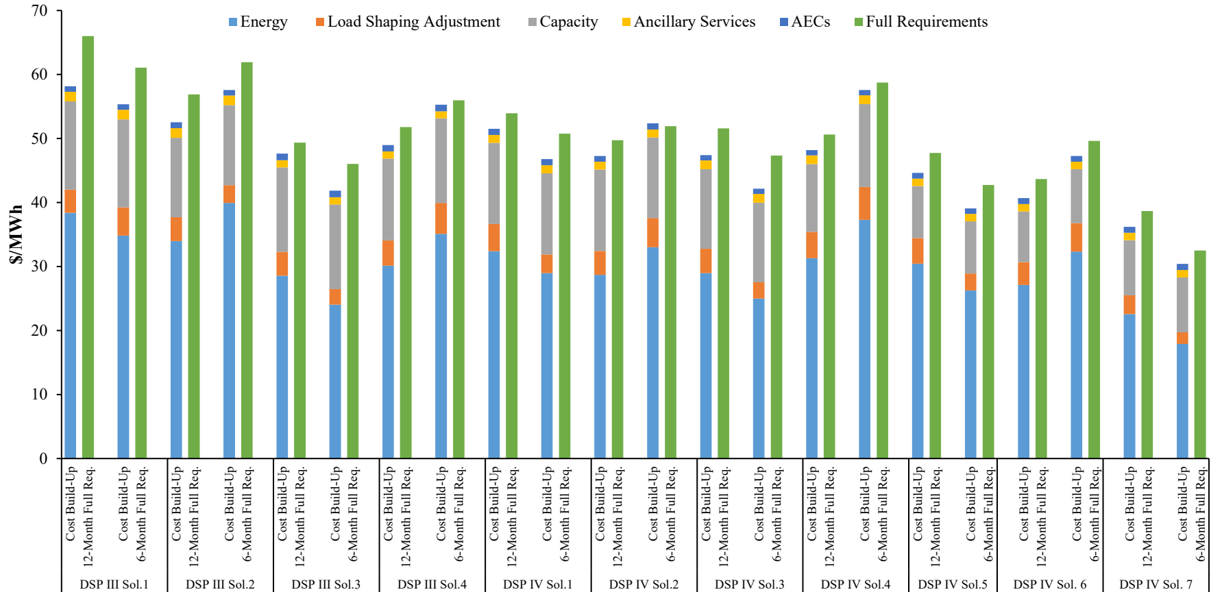
Exhibit JC-4 Revised Cost Build-Up v. Full Requirements Price Residential Customer Class DSP III, DSP IV