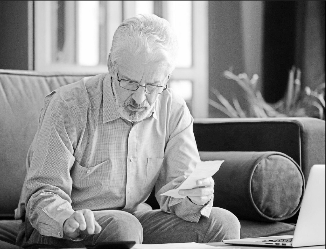
The internet offers abundant opportunities to create income from side jobs that aren't dependent on age or location. The possible income ranges from a few hundred to a few thousand dollars a month and lets you tap into a variety of skills that you've accumulated over the years.

Some of those jobs generate but a modicum of income. Others offer the possibility of meaningful paychecks in retirement. I've interviewed scores of retirees who earn a few hundred to few thousand